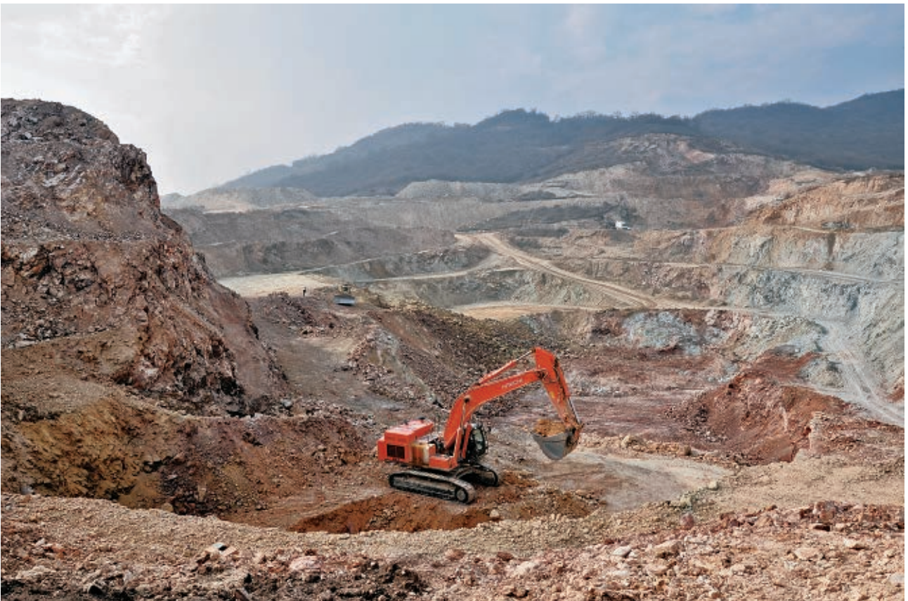
Picture 5, 6. Gold and copper mining in forest territories