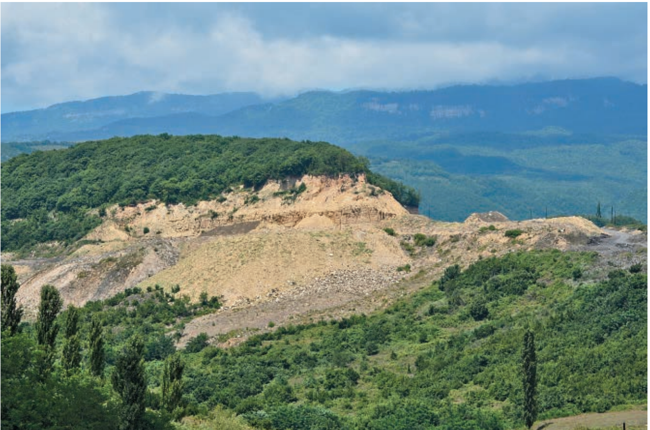
Pictures 1, 2. Manganese mining in forests, Chiatura district, West Georgia