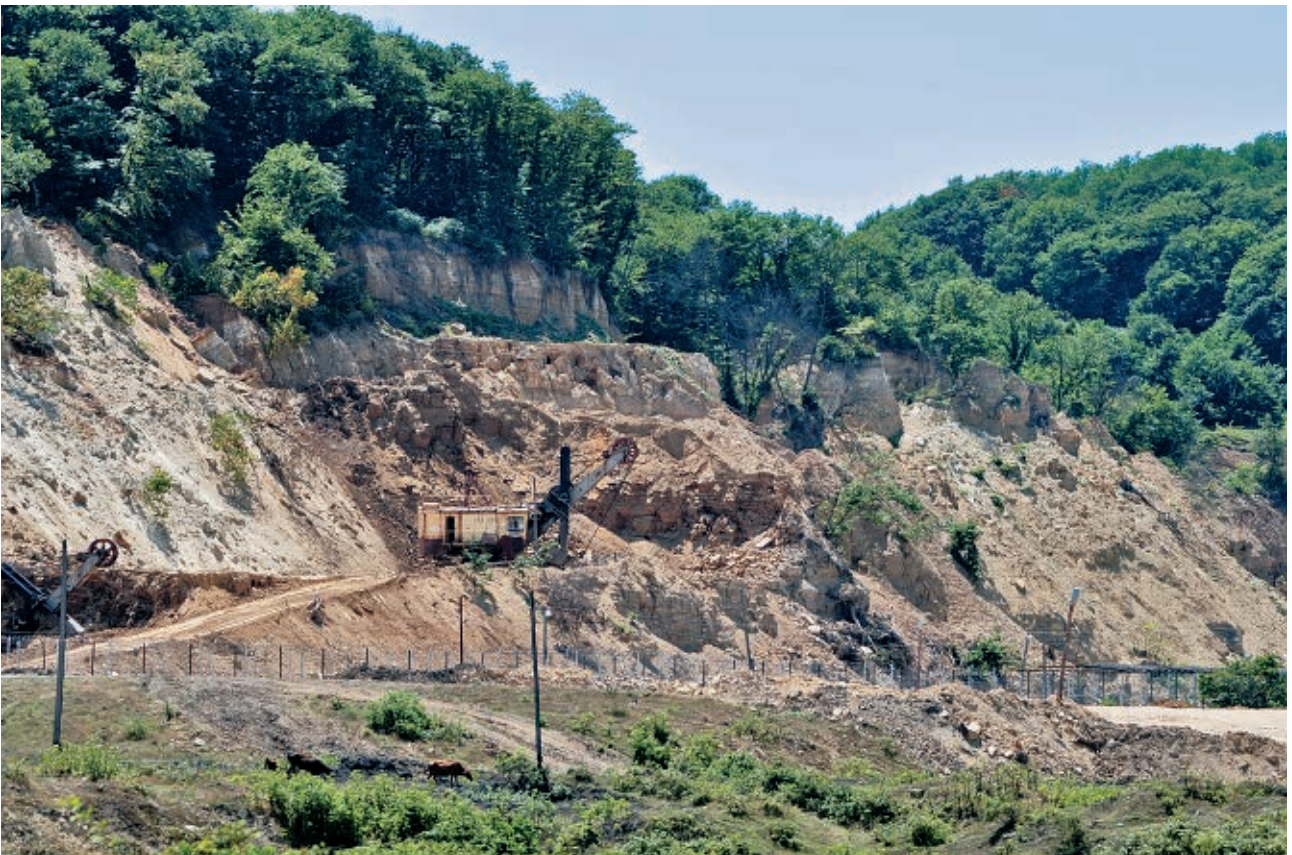
Pictures 3, 4. Chestnut forests being destroyed due to manganese open mining. Endangered chestnut is included in "National Red List" of Georgia