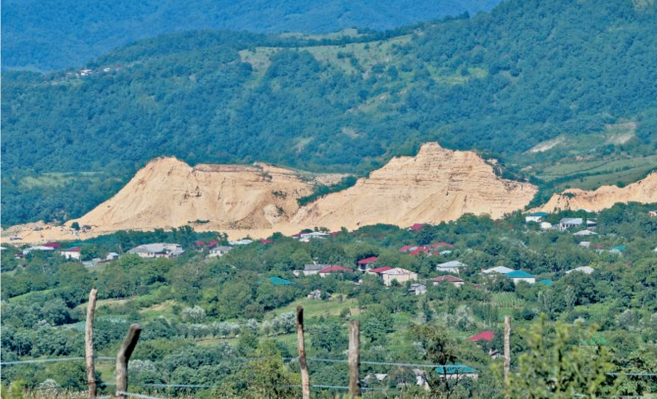
Picture 8. Clear cuts in forests of Surami ridge. Bako-Supsa pipeline