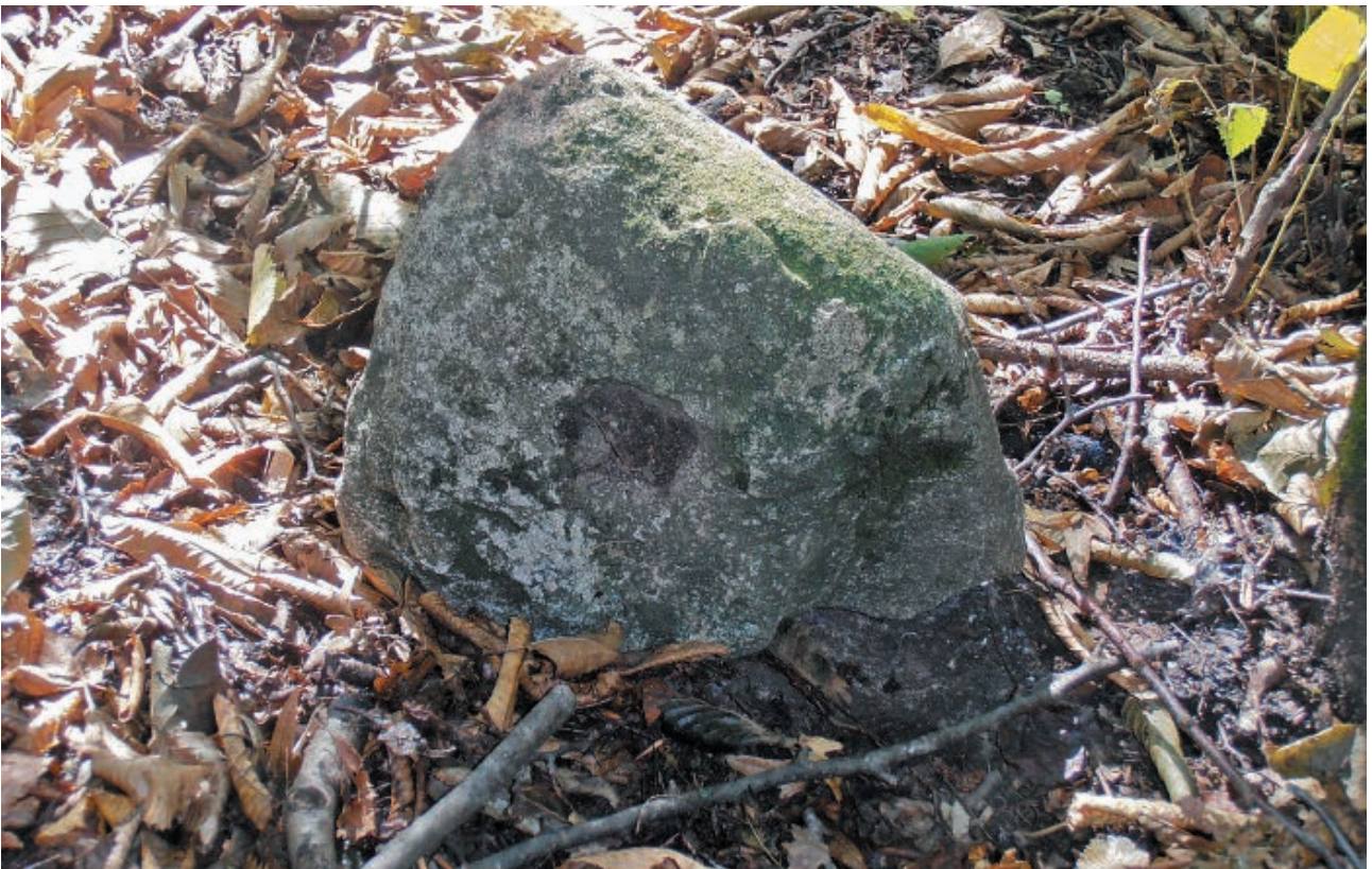
Pictures 11, 12. Forest which was owned by the community before the soviet period. Forest plots were divided by special stones - "Samani"